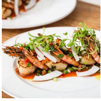
SCALLOP & PRAWNS