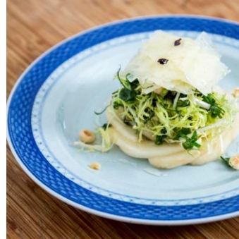
PEAR & MANCHEGO SALAD