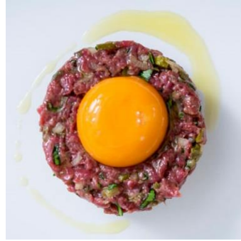
FALLOW DEER TARTARE