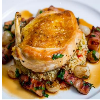
CORN FED CHICKEN