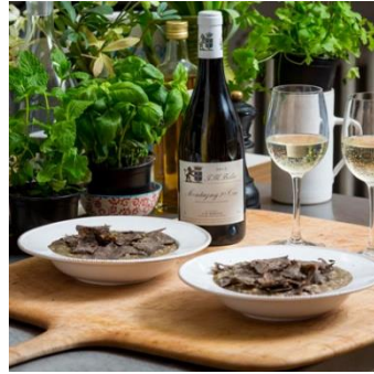
BLACK TRUFFLE RISOTTO