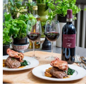
CALF'S LIVER WITH BACON